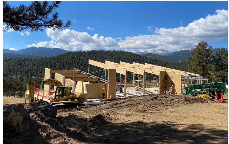
Progress at Mount Evans