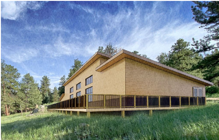
Drawing of Mount Evan's Dining Hall Design