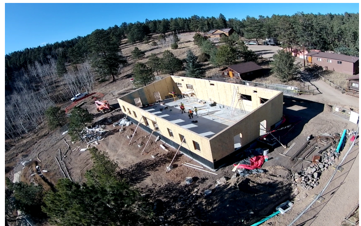
Progress at Windy Peak