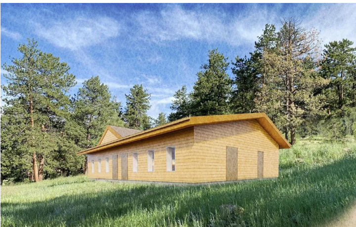
Drawing of Windy Peak's Bunkhouse Design